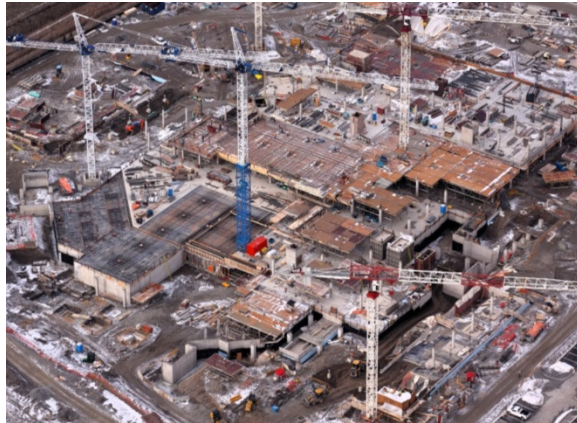
An aerial overview of the building taken January 27, 2010.