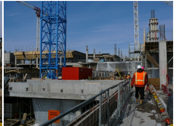
The building is taking clear shape above the future shipping and receiving docks.*

Together in Excellence – Leaders in Healthcare