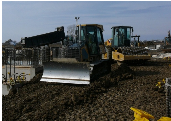
Over the past month workers have been backfilling the areas surrounding the foundations with earth stockpiled from the excavation.*