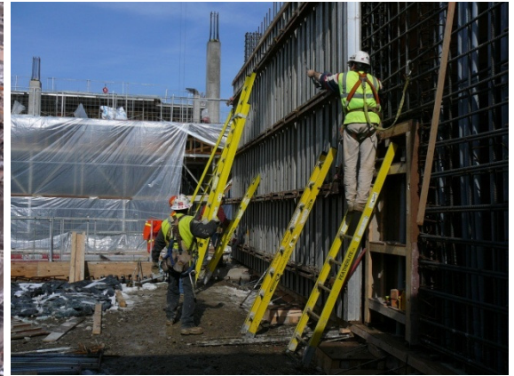
Work progressing outside of the stairwell located off the main entrance.*